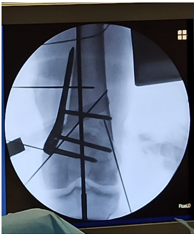
Figure 2 Medial open-wedge distal femoral osteotomy.

or post-traumatic must be addressed, if possible, before the onset of the arthrosis. DFO might also be beneficial in young, sportive patients, even with initial stage of osteoarthritis, who need a concomitant lateral meniscus allograft transplantation, in order to offload the lateral compartment and the freshly implanted allograft.