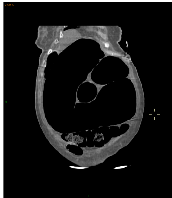
Figure 3: Abdominal-pelvic CT—coronal plane: colonic volvulus associated with a transmesocolic hernia with transmural necrosis of the colon sigmoid.

laparotomy during which a volvulus of colon sigmoid with transmural necrosis in a strangulated transverse transmesocolic and transmental (great omentum) hernia was identified (Figs 4 and 5). A Hartmann procedure was conducted and the patient was discharged at fifth post-operative day. At 3 months follow-up consultation, the patient remained free of complains.