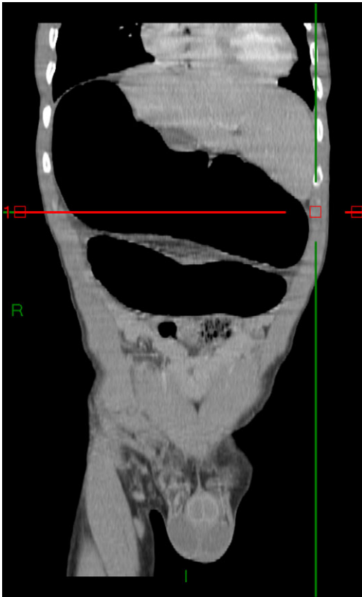
Figure 1: Abdominal-pelvic CT—coronal plane: colonic volvulus associated with a transmesocolic hernia with transmural necrosis of the colon sigmoid.

was admitted to the emergency department with generalized abdominal pain, nausea and vomiting. Physical exam revealed a distended abdomen, with pain in the epigastrium without tenderness. Laboratory investigation on admission was normal. Abdominal X-ray revealed a marked sigmoid colon distension suggestive of a colonic volvulus. A colonoscopy was conducted and revealed necrosis of the colon sigmoid apparently form a colonic volvulus. Abdominal-pelvic computerized tomography (CT) was conducted and a colonic volvulus associated with a transmesocolic hernia with transmural necrosis of the colon sigmoid was identified (Fig. 1). The patient was proposed to laparotomy during which a volvulus of sigmoid colon with transmural necrosis in a strangulated descendent transmesocolic hernia was identified. A Hartmann procedure was conducted and the patient was discharged at sixth post-operative day. At 2 year follow-up consultation, the patient remained free of complains, with the intestinal transit re-established.