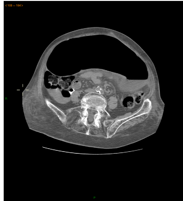
Figure 2: Abdominal-pelvic CT—transverse plane: colonic volvulus associated with a transmesocolic hernia with transmural necrosis of the colon sigmoid.

Case 2: A 92-year-old women, without previous abdominal surgery or history of abdominal trauma or peritoneal infections was admitted to the emergency department with generalized abdominal pain. Physical exam revealed markedly distended abdomen with generalized abdominal pain with tenderness. Laboratory investigation on admission: white cell count of 30.200/mm 3 with 84.7% neutrophils, protein C reactive of 13.6 mg/dL and lactates of 2.17 mmol/l. Abdominal X-ray showed a marked colonic enlargement. Abdominal-pelvic CT identified a colonic volvulus associated with a transmesocolic hernia with transmural necrosis of the colon sigmoid (Figs 2 and 3). The patient was proposed to