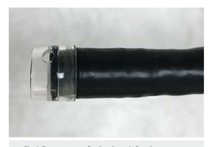
▶ Fig. 1 Transparent cap fixed to the end of a colonoscope.

Patients received split-dose polyethylene glycol bowel preparation. All procedures were performed using Olympus 180 high-definition white light colonoscopes (Olympus Medical Systems, Tokyo, Japan) under conscious sedation with midazolam, fentanyl or meperidine, with some patients getting diphenhydramine and/or promethazine as adjuncts. Three experienced endoscopists performed all colonoscopies. Based on patient