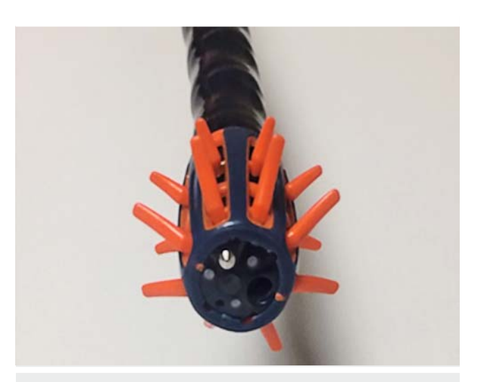
► Fig. 2 Endocuff with two rows of soft projections fixed to the end of a colonoscope.

randomization, the colonoscopes were either fitted with no distal attachment, Olympus 4-mm transparent cap (Olympus Medical Systems, Tokyo, Japan) or Endocuff (Arc Medical, Leeds, England) prior to colonoscope insertion. Bowel prep was graded using the Boston Bowel Preparation Scale (BBPS). Proximal colon was defined as colon segment proximal to the splenic flexure. Distal colon included splenic flexure and beyond. Polyp removal was by cold forceps, cold snare, or hot snare per endoscopists' discretion. All specimens were analyzed by three experienced gastrointestinal pathologists. Polyp size was as per specimen measurements in the pathology report. When fragmented, the sum of individual fragment sizes determined polyp size.