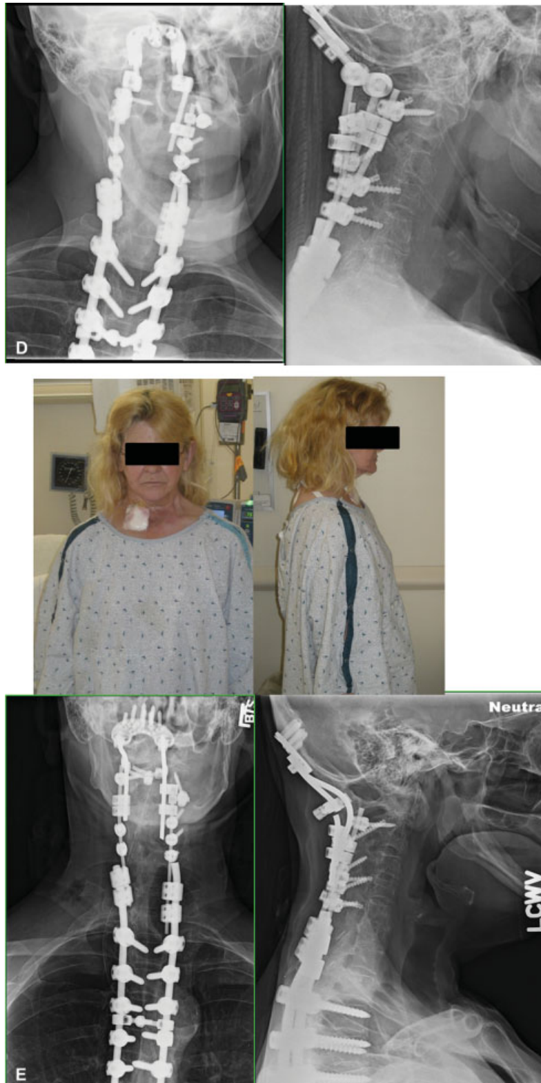
Fig. 2 Continued.

important difference for the NDI (change of 7.5). 12 Cobb angle measurements also demonstrated significant improvement from preoperative levels (35.1 to 15.7 degrees, p < 0.005 ). Complications occurred in 7 of the 13 (53.8%) patients. Most of the complications were surgical, and 3 were medical. The