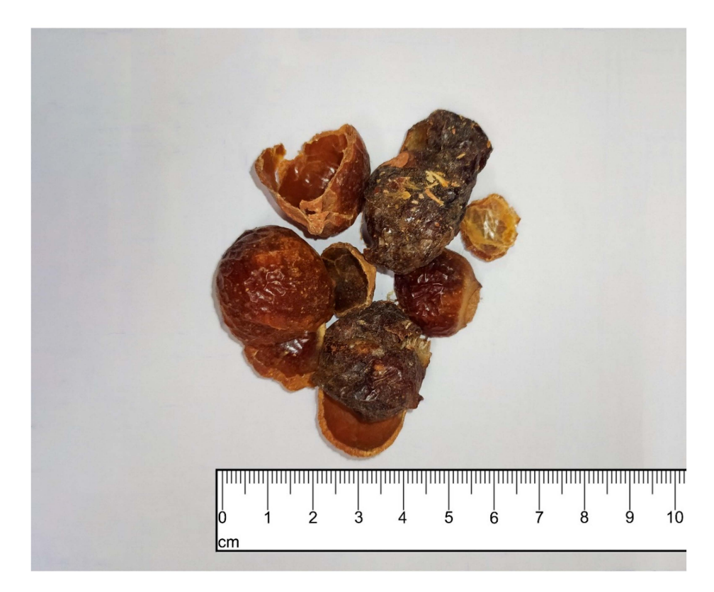
Figure 2. Commercially available, dry washnut pericarps.