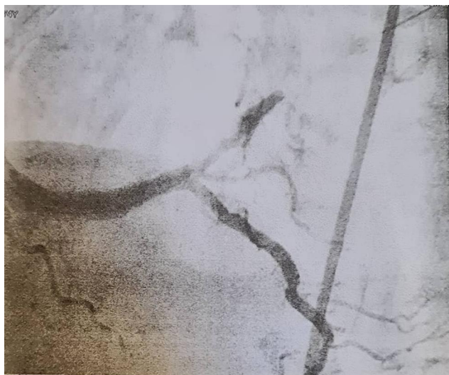
Figure 2 CT angiogram showing right coronary artery lesion.