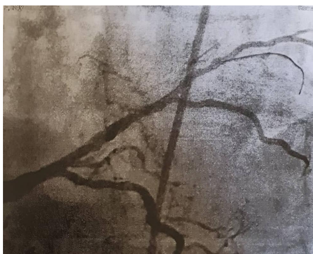
Figure 3 CT angiogram post percutaneous coronary intervention.

A 0.5% isobaric bupivacaine 4 mg with preservative-free morphine 75 mcg plus fentanyl 10 mcg (total volume of the LA mixture was 1.35 mL) was injected intrathecally. The patient was then placed supine and sensory block was confirmed up to L1 dermatome with modified Bromage score of 2 (unable to flex knee but able to flex ankle). She was given a total of 600 mL Ringers' lactate solution, IV paracetamol 1 g and supplemental oxygen via nasal prongs at 3 L/min was commenced which improved the SaO 2 to 99%. The patient remained hemodynamically stable throughout the left AKA and right femur back-slab application that lasted 42 minutes, heart rate ranged between 70 and 85 beats/min, systolic blood pressure 100–130 mmHg, diastolic blood pressure 50–75 mmHg. A cheerful theater