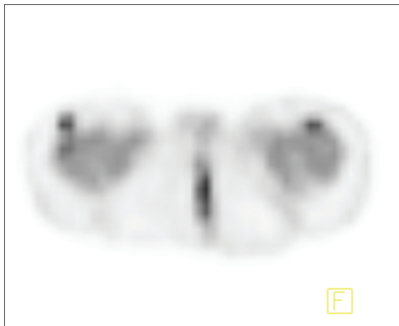
Figure 3: Select attenuation corrected axial 18F-fluorodeoxyglucose (18-F-FDG) positron emission tomography images of the bilateral thighs