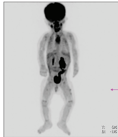
Figure 2: Whole-body maximum intensity projection