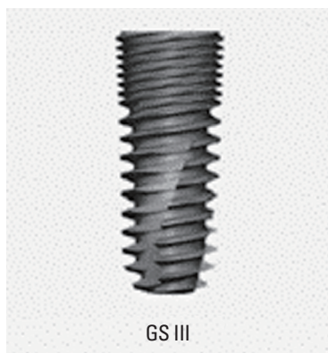
Figure 1. Illustration of GS III implant.

The patients were followed for more than 6 months after the final setting of the prosthesis, at which time periapical radiographs were taken using the parallel cone technique with an Extension Cone Paralleling device. All films were de-