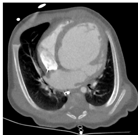
Figure 1. Retrospective electrocardiogram-triggered 320-multidetector cardiac computed tomography angiography image showing marked dilation of the left ventricle.

COVID-19 disease was suspected and SARS-CoV-2 polymerase chain reaction was positive. Captopril was withdrawn in the