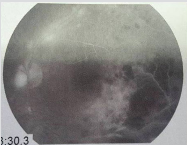
Figure 3. Fluorescein angiography: papilledema.