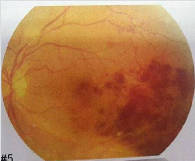
Figure 1. Fundus examination: retinal haemorrhages.

examination of duodenal biopsies revealed villous atrophy Marsh stage 3 with an increased number of intraepithelial lymphocytes. Anti-transglutaminase and anti-endomysial antibodies were negative, but antigliadin antibodies were positive (IgG >100 IU and IgA >100 IU). The diagnosis of CD was made. CRVO was explained by an acquired deficiency in proteins S and C due to a defect in their synthesis related to vitamin K malabsorption. Implementation of a gluten-free diet and iron supplementation resulted in an improvement in visual acuity to 8/10 and disappearance of the signs of malabsorption.