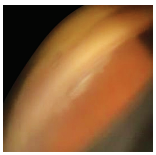
Fig. 2: Slit lamp photograph with gonioscopy, right eye, after anterior chamber reformation with viscoelastic. A cyclodialysis cleft is visible from 2:00 to 3:00

developed macula changes and his BCVA OD dropped to 20/40 + 2. Slit lamp examination did not show any filtration blebs. Anterior chamber was of moderate depth (Fig. 1A). Gonioscopy revealed closed angles with no improvement on indentation. Fundus examination revealed mild macular choroidal folds. UBM revealed a supraciliary effusion at 3:00 (Fig. 1B). Given the persistent hypotony, therapeutic and diagnostic anterior chamber reformation was performed with viscoelastic (Healon®). Repeat gonioscopy OD now showed grade III angles open to scleral spur with a cyclodialysis cleft from 2:00 to 3:00 (Fig. 2). IOP increased to 6 mm Hg. The patient subsequently underwent 3 sessions of argon laser photocoagulation OD. Six months after his cataract and KDB goniotomy, his visual acuity was OD 20/20 – 1 corrected with refraction OD plano –2.25 × 90 and IOP 14 mm Hg, with an improvement in the macular choroidal folds.