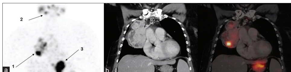
Figure 2: Images using 83 MBq (2,2 mCi) ^{99\text{m}}\text{Tc} sodium pertechnetate. (a) Maximum intensity projection visualizes accumulated activity in the intrathoracic thyroid tissue (arrow 1), in the salivary glands (arrow 2) and in the stomach (arrow 3). (b) Computed tomography with intravenous contrast and fused images as in Figure 1

the goiter extends further into the thorax the path of least resistance is towards the right. [3] Thyroid masses found after thyroidectomies are not common, and are most often the result of incomplete removal of a descending goiter or, more rarely, isolated congenital mediastinal thyroid tissue unconnected to the cervical portion that becomes hypertrophic after removal of functioning cervical thyroid tissue. [4] Such a condition is suspected when Thyroid Stimulating Hormone remains suppressed after surgery. [5] When presenting with obstructive symptoms, surgery is the first-choice treatment. Alternatively, radioiodine ablation can be used. [6] It has been reported that intrathoracic goiter does not always show on planar imaging. [7-9] Our images show strong consistency between activity distribution of both radiotracers in the intrathoracic thyroid tissue in as well SPECT imaging and planar imaging (image not shown). Considerations regarding the choice of the radiotracer have also been made and the ^{123}\text{I} has been preferred over ^{99\text{m}}\text{Tc} for intrathoracic goiter due to its higher target-to-background activity, greater tissue specificity, and lower blood pool activity. [10] The ^{123}\text{I} imaging is, however, often unavailable and more costly, and therefore not performed. Furthermore, as presented here, ^{99\text{m}}\text{Tc} imaging is usually sufficient, particularly in patients presenting with thyrotoxicosis.