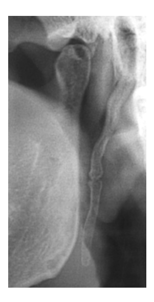
Figure 3 Type II – pseudoarticulated styloid process.