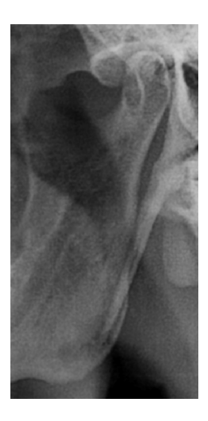
Figure 2 Type I – uninterrupted styloid process.