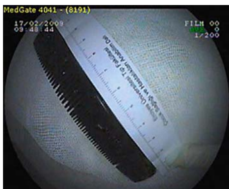
Fig. 3. Comb after removal.