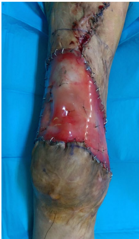
Figure 3. The appearance of Integra dermal regeneration template two weeks after placement. The Integra is unmeshed and applied with peripheral staples Central quilting sutures of 50 nylon to conform the matrix to the peri-patellar region.

patient was kept on strict bed rest at home and brought to clinic every fourth day for change of dressings and review.