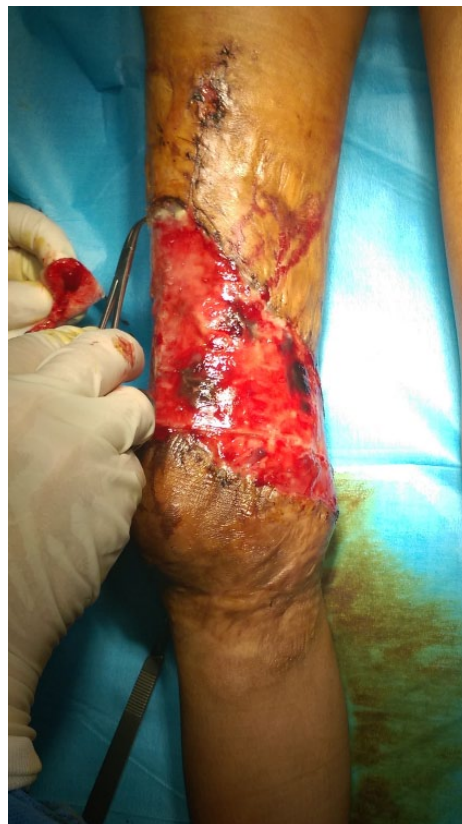
Figure 4. At three weeks the silicone membrane is removed to expose the peach-coloured, vascularized neodermis. Note two small anterior areas that have not vascularized anteriorly and remain deep purple.

The above report outlines our first application of Integra with Médecins Sans Frontières (MSF) in