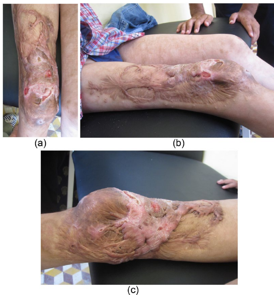
Figure 1. (a) Anterior, (b) lateral and (c) medial views of scarred right thigh and peri-patellar region 18 months after a de-gloving injury and partial take of a SSG reconstruction. Multiple unstable, open areas and crypts are seen within the scar tissue.