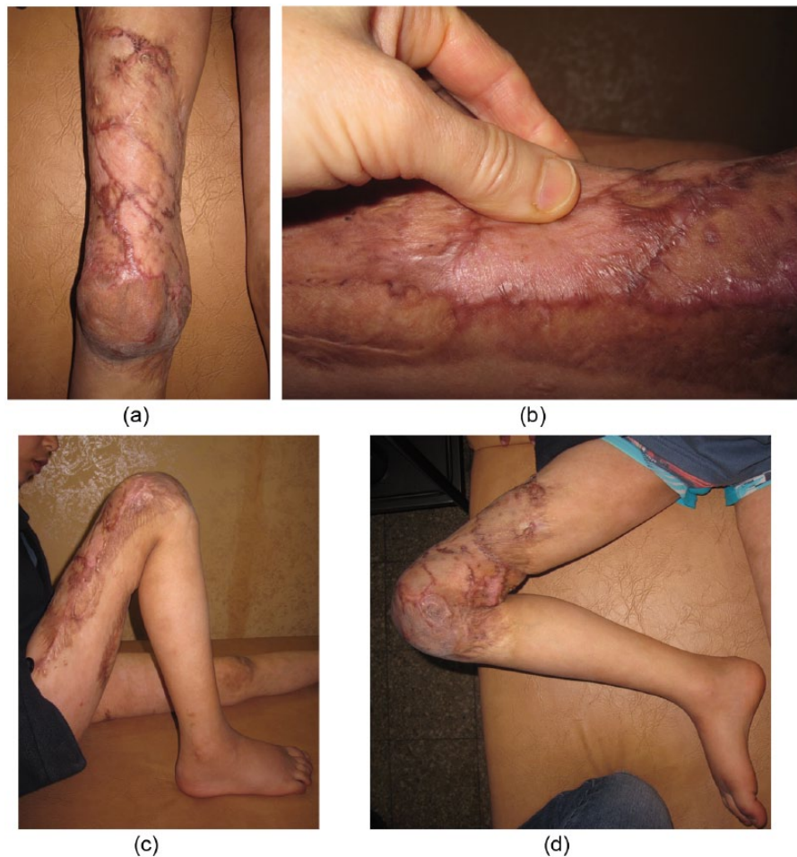
Figure 5. Six months post surgery: (a) the appearance of the reconstruction; (b) the elasticity and (c, d) the ease of movement of the limb.

and therefore reduction of overall inpatient length of stay and cost. 5