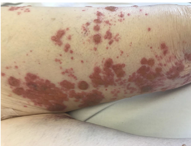
Fig. 3 Herpes zoster infection in a patient with hairy cell leukemia treated with cladribine

Opportunistic skin infections, including atypical mycobacterial skin infections, have also been reported in HCL patients [101, 102]. Trizna et al. present the case of a patient with HCL, who developed cutaneous tumor caused by Mycobacterium kansasii : surgical removal of the tumor