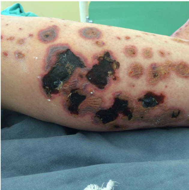
Fig. 4 Ecthyma gangrenosum in the patient with hairy cell leukemia associated with Pseudomonas aeruginosa bacteremia, manifested as painless red macule with surrounding erythema, followed by hemorrhagic bullae and cutaneous ulcerative lesions

trimethoprim-sulfamethoxazole, or granulocyte-colony stimulating factor [110, 113, 114].