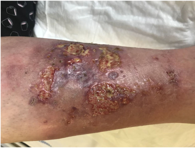
Fig. 2 Ulcerative pyoderma gangrenosum on the right tibial surface in the patient with hairy cell leukemia before treatment. Lesions completely resolved after treatment with cladribine treatment