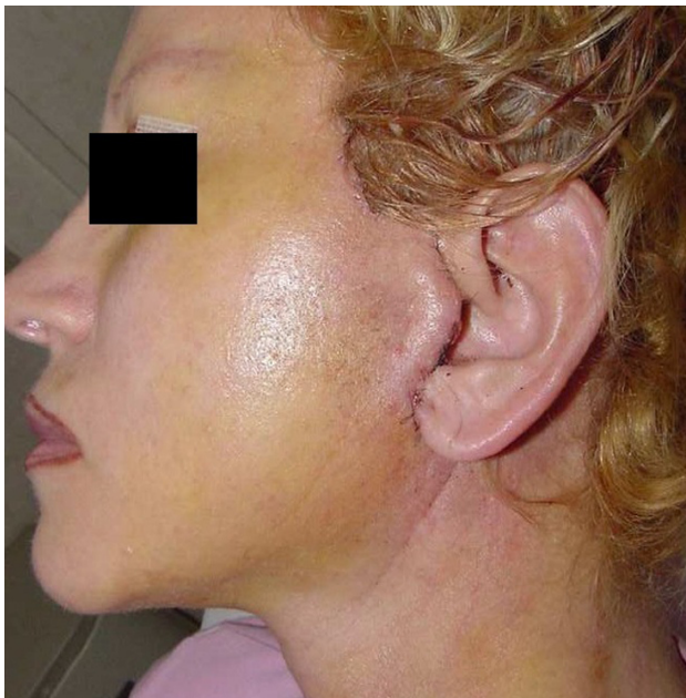
Figure 6 Appearance 3 days postoperatively after removal of eyelid sutures.