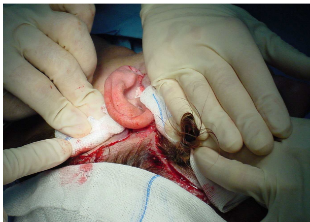
Figure 3 Excess glue is squeezed out from the dissected area through the skin incision and eliminated.

( P=0.357 , paired t -test). No cases of seroma or induration were observed, with only one bilateral case of slight ecchymosis and another bilateral case of moderate edema (more than the light usual one). The results are shown in Figures 6–9.