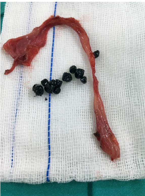
Fig. 2. Excised right inguinal hernia sac with ten 5 mm gallstones.

uation confirmed 10 foreign bodies of 5-mm in size to be cholesterol gallstones. The patient was discharged home two days later.