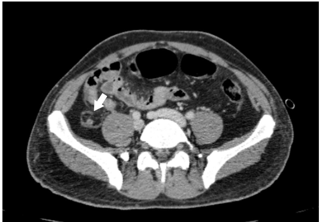
FIGURE 1: Dilated fluid-filled appendix with peri appendiceal inflammatory changes

A contrast-enhanced CT of the abdomen was subsequently performed to evaluate the cause of abdominal tenderness. There was no evidence of local disease recurrence on the scan. However, the appendix was dilated in caliber measuring up to 10 mm. It had surrounding inflammatory changes with peri appendiceal localized fluid collection and fat stranding (Figures 1-2). Upon a detailed look using different windowing levels, a note was made of a focal defect in the appendiceal wall integrity which was not disrupted on the serosal aspect. The appendix was enhancing and contained some intraluminal fluid. There were moderate ascites as well. Considering the overall appearances, a diagnosis of sealed off appendiceal perforation was made.