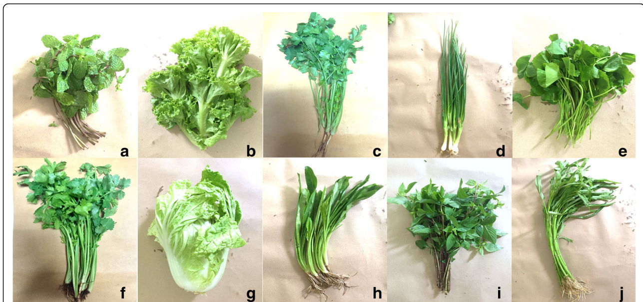
Fig. 2 The pictures of vegetable samples including a. peppermint ( Mentha x piperita ), b. lettuce ( Lactuca sativa ), c. coriander ( Coriandrum sativum ), d. leek ( Allium porrum ), e. gotu kola ( Centella asiatica ), f. celery ( Apium graveolens ), g. Chinese cabbage ( Brassica rapa subsp. pekinensis ), h. culantro ( Eryngium foetidum ), i. Thai basil ( Ocimum basilicum ), and j. Chinese morning glory ( Ipomoea aquatica )

Table 2 shows the prevalence of parasitic contamination in different vegetable samples among the three markets. The parasites were detected in 51.5%, 30.6%, and 17.9% of samples obtained from Mueang, Thasala, and Sichon districts, respectively. The highest rate of parasitic contamination in vegetables was found in