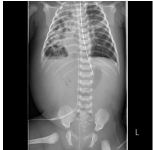
Fig. 2 X-ray showing distended bowel loops in right hemithorax prior to emergency surgery in NICU. NICU, neonatal intensive care unit.

distended and showed signs of guarding. Minimal aspirates were obtained from the NG tube and bowels last opened on day 4. Arterial blood gas reported a pH 7.30, \text{pO}_2 (partial pressure of oxygen) 8.4 kPa, \text{pCO}_2 (partial pressure of carbon dioxide) 8.68 kPa, lactate 1.6, \text{HCO}_3^- 26.8, and base excess +5.3. Laboratory counts showed hemoglobin (Hb) 154, white blood cell (WBC) 15.3, platelets (Plts) 414, and C-reactive protein (CRP) 0.8. A repeat X-ray (–Fig. 2) showed new distended bowel loops in the right hemithorax.