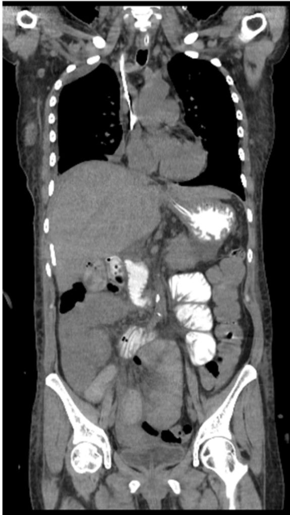
Figure 1 Computed tomography image (coronal view) showing small bowel obstruction associated with a subphrenic collection.