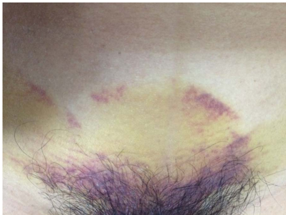
Fig. 2. Cullen's Sign on lower abdomen.

On the ninth day of admission, the patient complained of sudden pain in the lower abdominal region with a visual analogue score (VAS) of 8. On physical examination, there was a palpable, painful, firm, and nonpulsatile mass in the lower abdominal region with the size of approximately 9 cm × 6 cm that was positive for Cullen's sign (Fig. 2). The patient was referred for a surgical consult. Her laboratory results on that day showed hemoglobin 11.1 g/dL, hematocrit 32%, leukocyte 6400/μL, platelet count 116,000/μL. An abdominal computed tomography (CT) scan was performed which revealed a hematoma on the rectus abdominis muscle (not shown). The patient was managed with analgesics and discharged in a stable condition by her own request. She was advised to undergo serial magnetic resonance imaging (MRI) to further confirm the diagnosis and to return for follow up three days post-discharge.