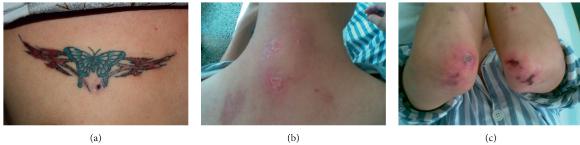
FIGURE 1: Clinical manifestation of the patient. (a) The patient with a butterfly tattooed on his chest. (b, c) Typical CADM rash in the back of neck and bilateral elbow.