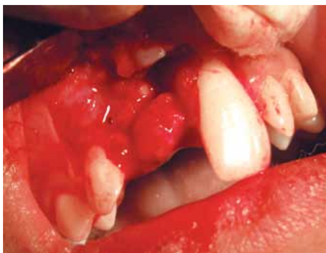
Fig. 4: Mass of soft tissue seen superficial to the odontome