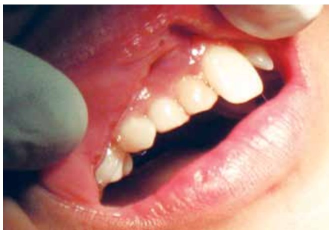
Fig. 1: Preoperative view—retained deciduous incisors, missing permanent incisors

The case described in this study was diagnosed initially as odontoma as the radiographic examination showed calcification similar to that of teeth. Histological examination of