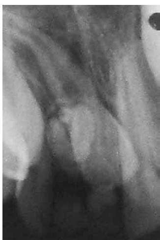
Fig. 3: Periapical radiograph showing a single lesion of compound odontoma