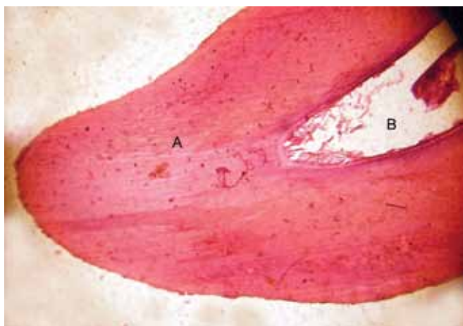
Fig. 7: Decalcified section of the odontome showing (A) dental tubules, (B) pulpal space