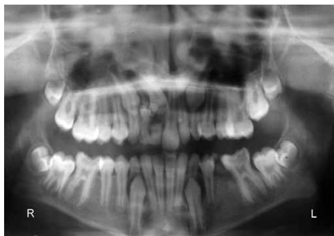
Fig. 2: Panoramic radiograph showing a single calcified mass