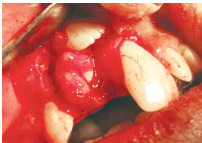
Fig. 5: Exposure of the odontoma following removal of soft tissue

presence of the missing permanent lateral incisor is of course a unique entity and it may be theoretically considered that trauma can be an etiologic factor. Spontaneous eruption of an impacted tooth after removal of a supernumerary tooth or odontoma depends on several factors, such as distance of the apex of the impacted tooth relative to its midline, time of surgery relative to the expected eruption time of the impacted teeth and loss of space, estimated position, depth of impaction, angle of impaction relative to the midline, time of surgery relative to the expected eruption time of the impacted teeth. 15 The treatment of choice for these impacted teeth associated to odontomas appears to be removal of the lesion with preservation of the impacted tooth. The latter in turn require clinical and radiological follow-up for at least one year. If no changes in the position of the tooth are seen during this period, fenestration followed by orthodontic traction is indicated. Extraction advised when the tooth is ectopic or heterotopic, with morphological alterations, or presence of cystic lesions. 16 Orthodontic therapy for alignment of the impacted central incisor has been suggested.