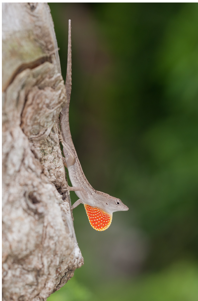
Figure 1 Brown anole ( Anolis sagrei ). Photograph of a male brown anole extending its dewlap. Picture taken by Steven De Decker in Santa Clara, Cuba (2012).

containing males in order to avoid any visual or chemical contact between them. Each cage contained a layer of peat bedding covered with banana-leaves and several wooden perches (length 40 cm; diameter 3 cm). A 60-watt bulb suspended above one end of the terrarium provided heat and light (12 h/d). Lizards were hand-sprayed with water every other day, had access to fresh water at all times, and were fed crickets ( Acheta domesticus ) three times a week. The lizards were housed in one room whilst the experiments took place in a separate room. All work was carried out in accordance with the University of Antwerp animal welfare standards and protocol (ECD 2011-64).