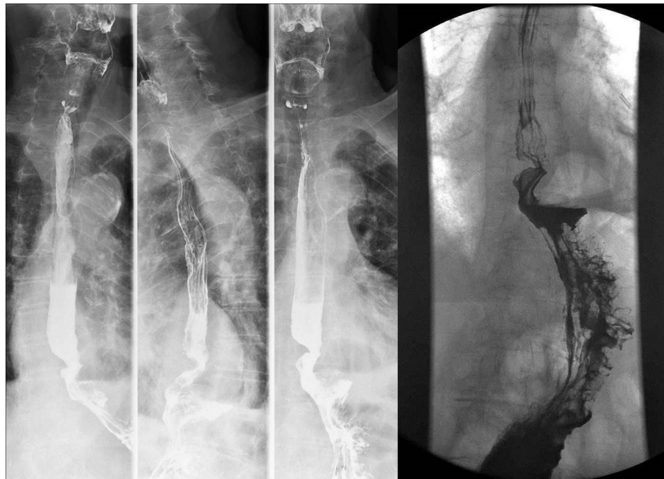
Fig. 4. Contrast study of the oesophagus one month after discharge from the hospital. The patient was on a free diet and she experienced no transit discomfort.

astinum at an early stage. Back drainage of infected material into the oesophageal lumen may be occurred. We observed one additional patient in the past with a diagnostic delay of 10 days and with a similar clinical presentation as the present. Still, he was very elderly. It may be speculated that a sort of age-related hyporeactivity of patients could play a role.