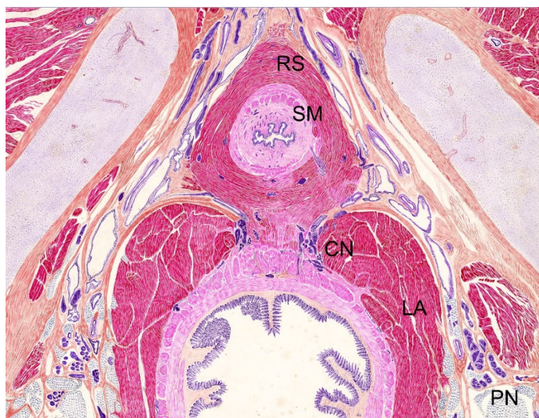
Figure 2. Indian ink on paper drawing from histotopographic 40- \mu m transverse section of a male fetus from the Salvador Gil Vernet collection (courtesy of Jose Maria Gil-Vernet Sedó) revealing the omega-shaped circular bundles of rhabdosphincter (RS), inner circular bundles of smooth muscle (SM), levator ani (LA), cavernous nerve (CN) and pudendal nerve (PN).

Anatomic studies regarding the preservation of erectile function after bulboprostatic anastomosis led to better characterization of the cavernous neurovascular bundle paths, and also to the discovery of a delicate sheath of connective tissue between the wall of the membranous urethra and the surrounding circular fibers of the external sphincter [25,27]. This sheath can be used as a surgical plane to separate the urethral wall from the sphincter. The circular muscle fibers of the external sphincter can be reflected from the sheath until the underlying urethral wall is identified and dissected [8]. This allows intra-sphincteric dissection to perform bulboprostatic anastomosis or intrasphincteric anastomotic urethroplasty, as defined by Gómez et al., preserving continence and sparing the bulbar vessels [17]. This technique is optimal in cases with short and occlusive stenosis of the membranous urethra, especially in men after BPO surgery. However, cases with longer stenosis may benefit more from augmentation techniques.