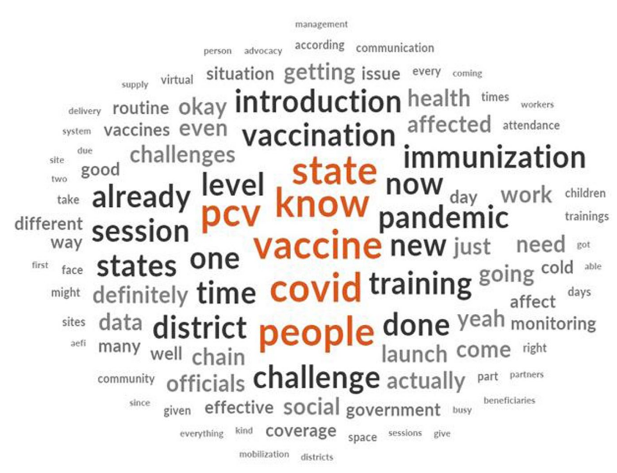
Figure 3. Word Cloud for all interview transcripts.

This was severely impacted because of COVID pandemic," mentioned participant 8.