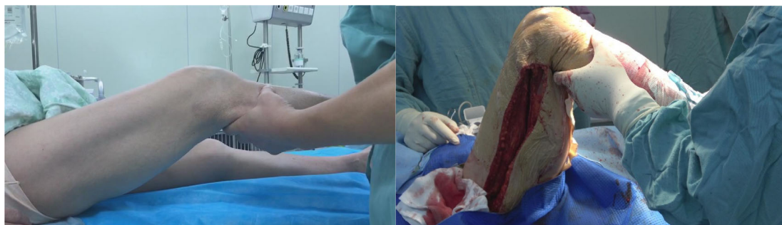
Fig 3 Description of case 4 (see Table 1). Sequelae of patella fracture treated with open reduction and internal fixation (ORIF), with severe lack of knee flexion. Phase 4 of the Judet procedure led to a significant flexion gain.