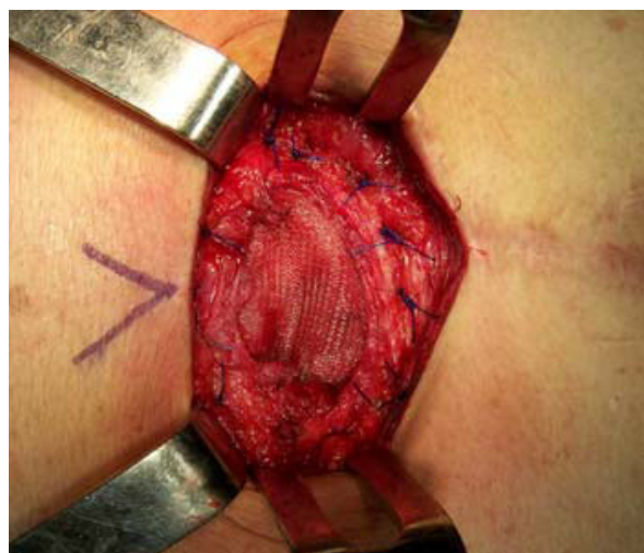
Figure 2 Epigastric Incisional hernias