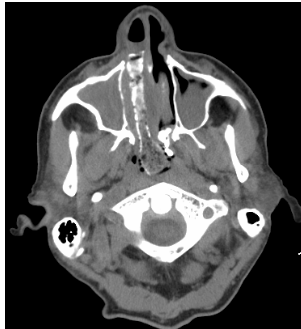
Figure 3 Transverse view of the calcified foreign body. Extensive sinusitis of the right and left maxillary sinuses is evident.