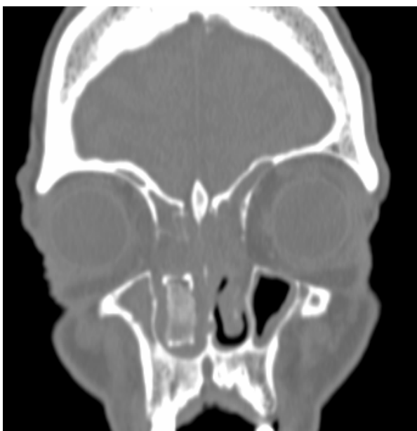
Figure 1 Coronal view of the intra-nasal foreign body.

The majority of cases of intra-nasal foreign bodies are asymptomatic, except for a history of a foreign body having been inserted in the nose. Common symptoms, if present, include pain or discomfort, nasal discharge, nasal congestion or nasal odor. A unilateral mucopurulent nasal discharge with foul odor is the most consistent