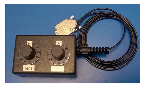
Figure 2. NovoTHOR randomising switch box.

Assessment of primary and secondary outcome measures will be at baseline, after treatment 6, immediately following the last treatment (4 weeks) and then 2 weeks and at 3 monthly follow-up intervals to 6 months after completion of treatment. A flow diagram illustrates these assessment times (Figure 3).