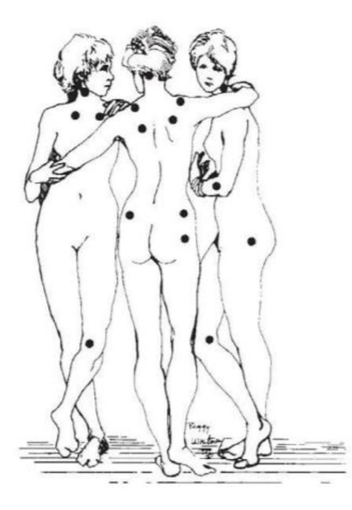
Figure 4. Location of tender points established as criteria for fibromyalgia syndrome (FMS) diagnosis by the American College of Rheumatology (ACR).<sup>3</sup> Image based on the original 'The Three Graces' by the French 154 painter Jean-Baptiste Regnault (1793).

with five bars being the most acceptable) will be used to evaluate the recommended compression size. The exact raw strain value (0–6; with 0 being softest and 6 being the hardest tissue) will be calculated using a 5-mm circular region in a soft part of the area of interest, as indicated by the manufacturer's instructions and shown in previous studies.<sup>33</sup> A mean of three measurements at each point will be calculated to minimise intraobserver variation. Only sequences with the highest image quality (with green bars on the quality assessment) were used as recommended by the manufacturer.