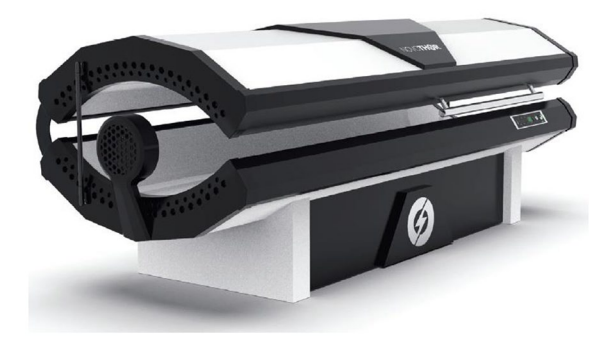
Figure 1. NovoTHOR bed.

The placebo feature of the whole-body PBM bed provides controls that select active or placebo (sham) treatments in a way undetectable by participant, operator or observers, such that no one is aware whether the participant is receiving an active or placebo treatment. There is a switch box (see Figure 2) that randomises participants to active or placebo; no other randomisation is necessary. With this system, if the operator becomes unblinded, they will only discover which treatment that particular participant is getting,