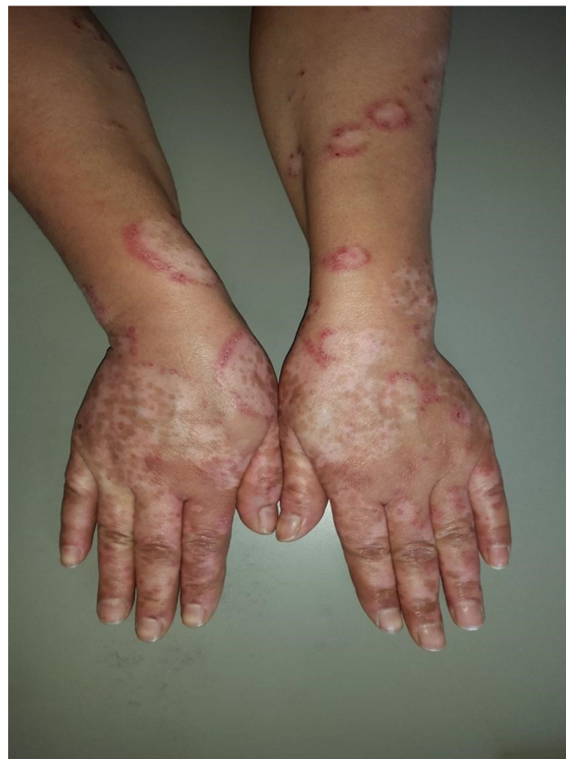
Figure 1 Psoriatic lesions superimposed on vitiligo patches and forming advancing border of vitiligo lesion.

The frequency of psoriasis among healthy control was 2 (0.4%) versus 15 (6%) among vitiligo patients. There was a statistically significant difference ( P value < 0.001 ; Table 2).