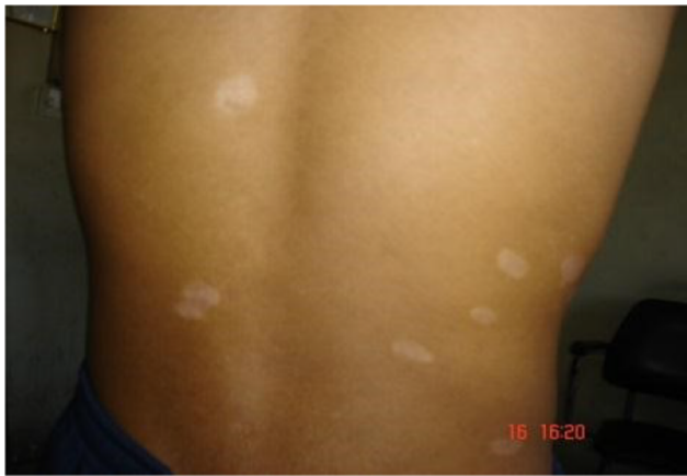
Figure 3 Leukoderma or vitiligo following healing of psoriasis.

patients with psoriasis had a lower chance to develop vitiligo as frequency of psoriasis among vitiligo patients was 6% while the frequency of vitiligo among psoriasis was 2% only.