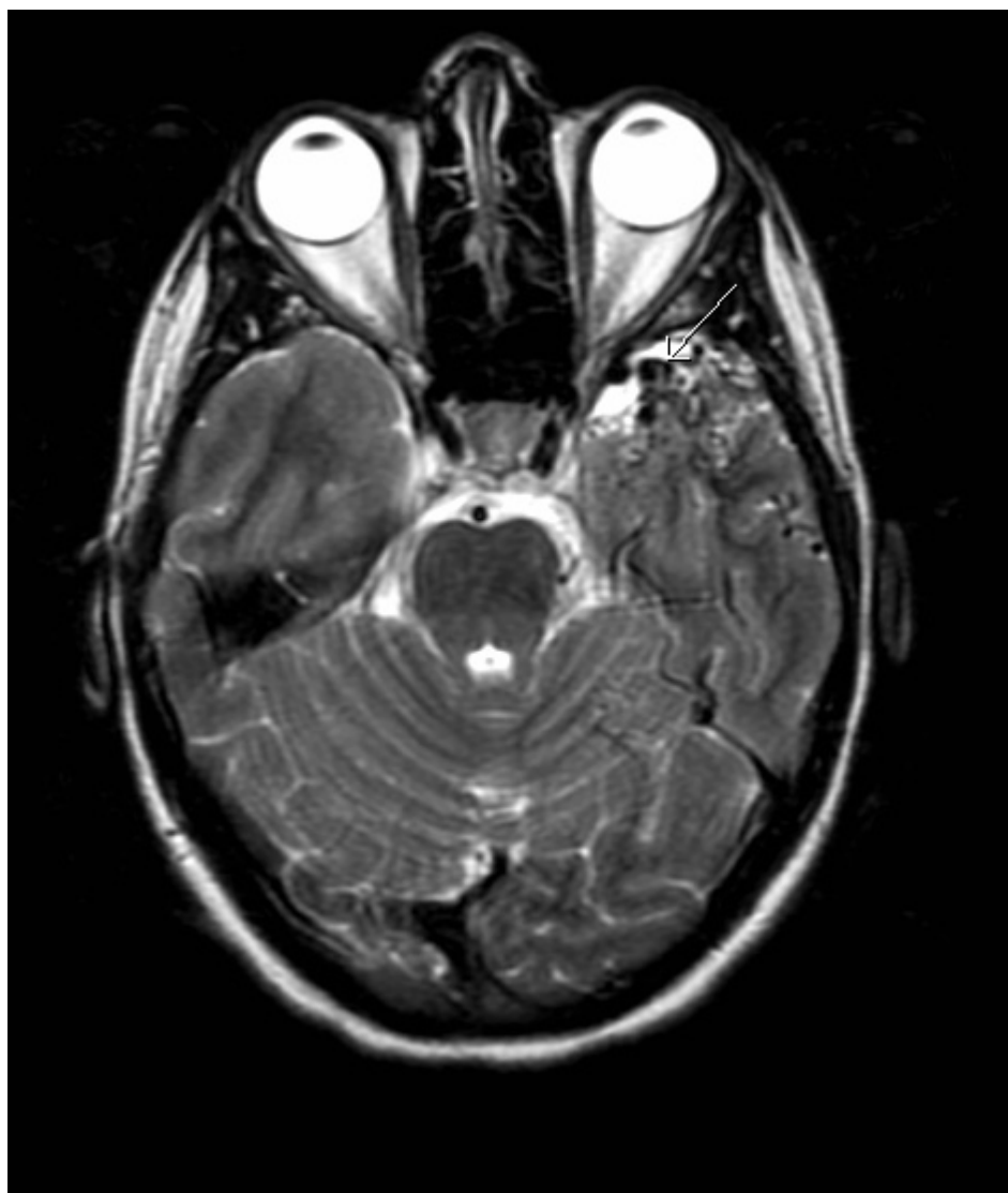
Figure 2 Axial T2- weighted MR image showing multiple abnormal flow void (arrow) signals indicating presence of an arteriovenous malformation in the left temporal lobe.

of patients with ICH. The progression of neurological deficits in many patients with an ICH is frequently due to ongoing bleeding and enlargement of the hematoma during the first few hours (Kazui et al 1996; Brott et al 1997; Fujii et al 1998). Compared with patients with ischemic stroke, headache and vomiting at onset of symptoms is observed three times more often in patients with ICH (Gorlick et al 1986; Rathore et al 2002). Despite the differences in clinical presentation between hemorrhagic and ischemic strokes, brain imaging is required to definitively diagnose intracerebral hemorrhage.