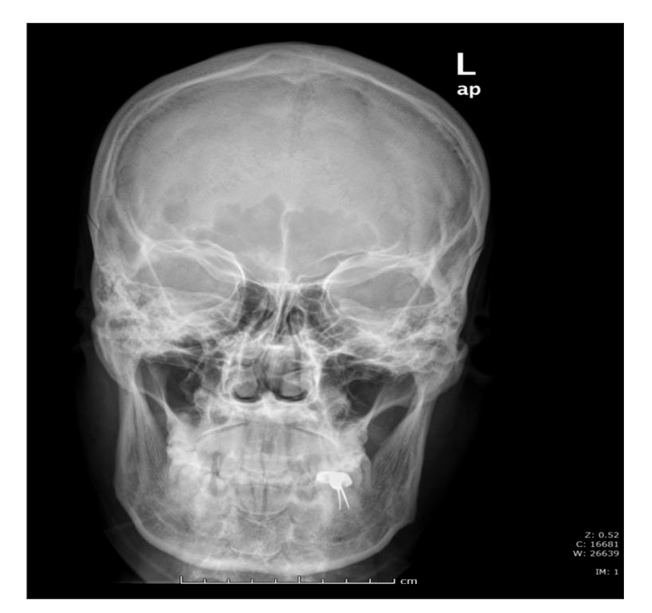
Figure 1. X-ray of skull anteroposterior view shows subtle heterogeneity of bone marrow of both mandibles with no definite focal osseous lesions.

Laboratory results revealed hemoglobin of 3.6 mg/dL (normal range: 13.0-17.0 mg/dL), platelet of 12 \times 10^3 \mu L (normal range: 150-400 \times 10^3/\mu L), WBC of 6.3 \times 10^3/\mu L (normal range: 4.0-10 \times 10^3/\mu L). Based on the picture of bicytopenia, peripheral smear was sent and it showed marked neutropenia with left shift, dysplastic features, and 47% circulating blasts with some Auer rods, a picture highly suggestive of acute myeloid leukemia, and that was confirmed by flow cytometry of bone marrow aspirate with the presence of 52% abnormal precursors. Chromosome analysis revealed 45, X,-Y with t(8;21)