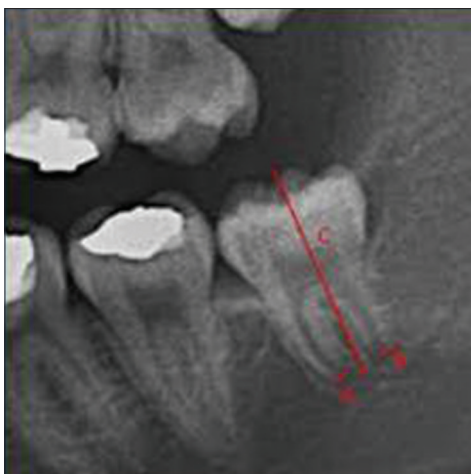
Figure 1: Cameriere's third molar maturity index.jpg

of the root pulp were recorded. Analysis was done by SPSS Version 20 (IBM Corp. Released 2011. IBM SPSS Statistics for Windows, Version 20.0., Armonk, NY: USA, IBM Corp). The CA was calculated by subtraction of date of birth date from the date of radiograph exposure and recorded as years and 1/10 of years. For each stage, a minimum and a maximum were noted and a median with upper and lower quartiles and also mean and standard deviation were calculated.