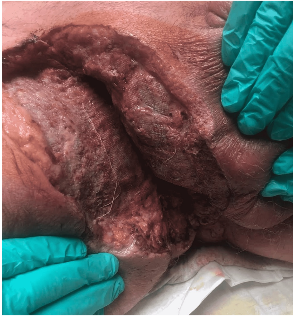
FIGURE 2: Right Inguinal region during debridement

Foul-smelling dishwasher-like fluid was drained. The testes and tunica vaginalis were not involved and were spared in dissection. The patient was empirically started on vancomycin, piperacillin-tazobactam, and clindamycin. Wound cultures grew Streptococcus anginosus and Staphylococcus epidermidis and the antibiotic was simplified to ampicillin-sulbactam based on culture results. The patient had right inguinal wound closure surgery of the right groin 11 days later with no complications (Figure 3).