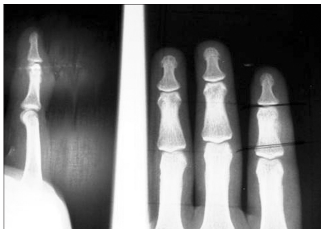
Figure 2: Paraosteal sclerotic lesion