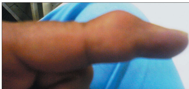
Figure 1: Fusiform mass in dorsal aspect of the index finger