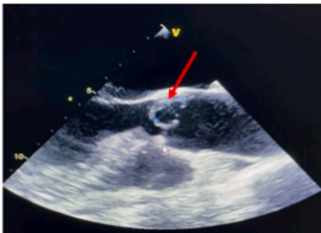
Fig. 1. Midesophageal-aortic valve short-axis view showing aortic root abscess (arrowheads) in relation to noncoronary cusp.

The pathophysiology of infective endocarditis involves complex interactions between circulating microorganisms, the injured valvular endothelium, and the host's immune defenses. The epidemiology of infective endocarditis has been subjected to important modifications during the last decades, it affects more often older, prosthetic devices