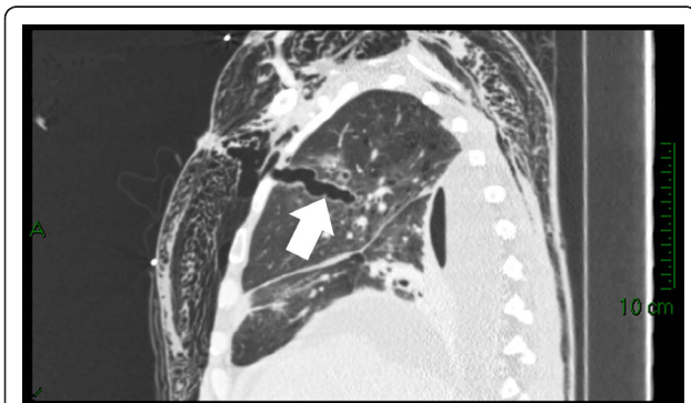
Figure 2 Right upper lobe laceration (arrow) containing gas communicating with the anterior chest wall (post ICD removal).

We believe the BTS guidelines [1] require a new revision with the view to including the mechanical ventilation as a hazardous clinical setting in “pre-drainage risk