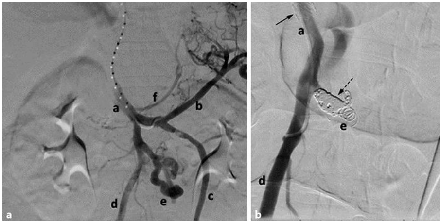
Fig. 2. a Digital subtraction angiographic image performed during the transjugular intrahepatic portosystemic shunt (TIPS) procedure demonstrates prominent duodenal varices extending from the inferior mesenteric vein (IMV). Additionally, there is a small coronary vein noted from the main portal vein (MPV). b Focused digital subtraction image of the MPV and IMV confluence after TIPS placement (solid arrow) as well as postembolization of the duodenal varices (dashed arrow) demonstrating no further flow within the varices. a, main portal vein; b, splenic vein; c, superior mesenteric vein; d, inferior mesenteric vein; e, duodenal varices; f, coronary vein.