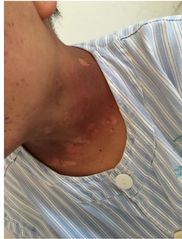
Fig. 7 Patient with severe radioactive dermatitis, the patient stated tingling in the irradiation area, the skin was gray, with multiple small ulcerations and a small amount of seepage

27.091, respectively, with significant differences ( P < 0.05 ). It showed that there was a linear trend in each group, and the occurrence of skin pain increased with time (Figs. 2, 3, and 4).