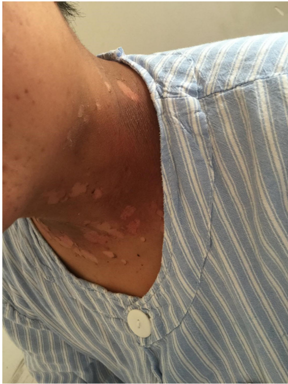
Fig. 8 The second irradiation