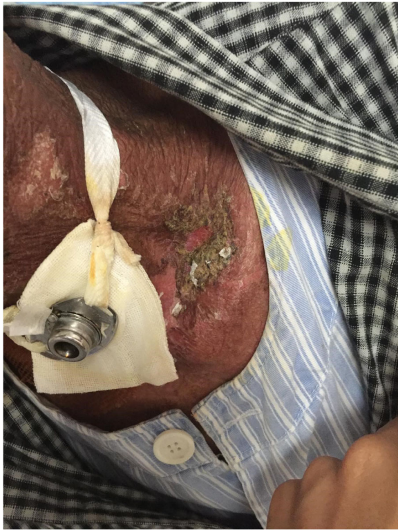
Fig. 2 Patient with severe radioactive dermatitis, the patient stated that skin was painful, and skin surface ulceration and secretion could be seen. The second irradiation, the wound was basically dry and the pain was less than before