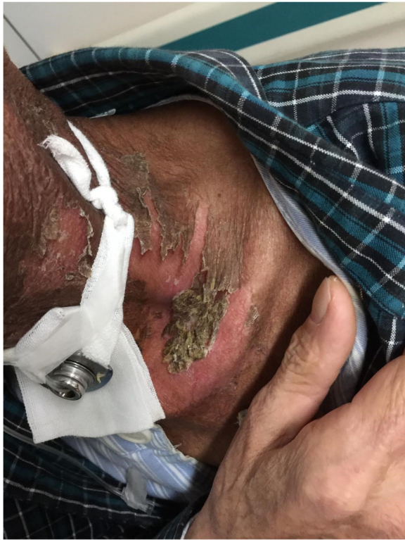
Fig. 4 Patient with severe radioactive dermatitis, the patient stated that skin was painful, and skin surface ulceration and secretion could be seen. The sixth irradiation