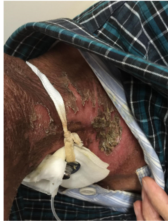
Fig. 3 Patient with severe radioactive dermatitis, the patient stated that skin was painful, and skin surface ulceration and secretion could be seen. The fifth irradiation, the scabs came off, and pain was almost gone

All patients were randomly divided into two groups, control group ( n = 30 ) and experimental group ( n = 30 ). There was no significant difference in the general data between the two groups, gender distribution ( P > 0.05 ), educational background distribution ( P > 0.05 ), and payment methods ( P > 0.05 ). In terms of age distribution, the experimental group was 46.4 \pm 11.91 years old, and the control group was 45.23 \pm 12.70 years old; there was no significant difference between the two groups ( P > 0.05 ) (Table 1).