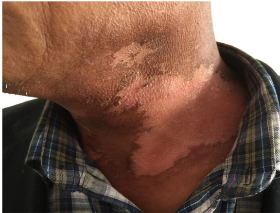
Fig. 15 The sixth irradiation, and the new skin was formed

but also guarantee the smooth progress of the patients' radiotherapy and improve their quality of lives, which is worth the popularization and application in the clinical practice.