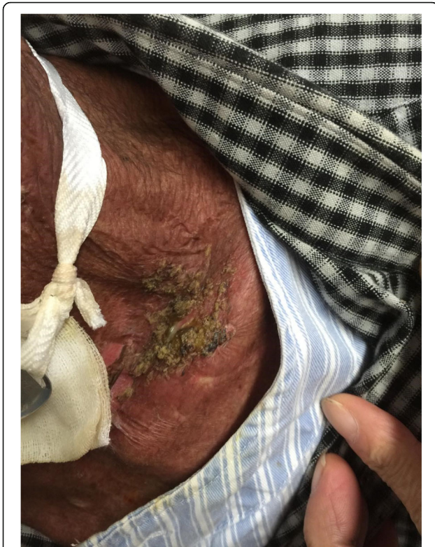
Fig. 1 Patient with severe radioactive dermatitis, the patient stated that skin was painful, and skin surface ulceration and secretion could be seen. Before irradiation

cancer, 2 cases were tonsillar carcinoma, and 2 cases were tongue cancer. And males were 42 cases, accounting for 70%; females were 18 cases, accounting for 30%; aged 24–75 years. In addition, education background below junior high school was 14 cases, accounting for