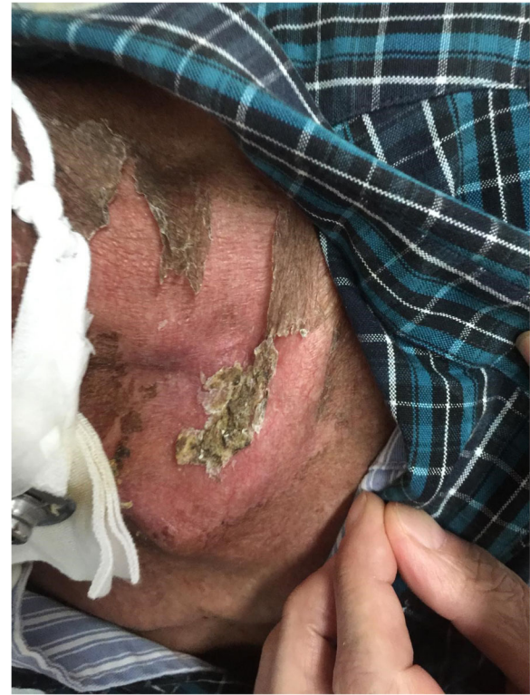
Fig. 5 Patient with severe radioactive dermatitis, the patient stated that skin was painful, and skin surface ulceration and secretion could be seen. The seventh irradiation

number from 0 to 10. 0 was painless; 1–3 was mild pain, which can be tolerated; 4–6 was moderate pain, which is severely disturbed, accompanied by irritability or passive position [8]. The participants chose one of the numbers according to their personal pain feelings. NRS had good reliability and validity, and was easy to record.