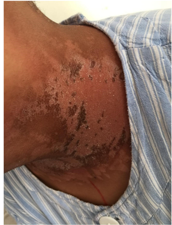
Fig. 10 The fifth irradiation