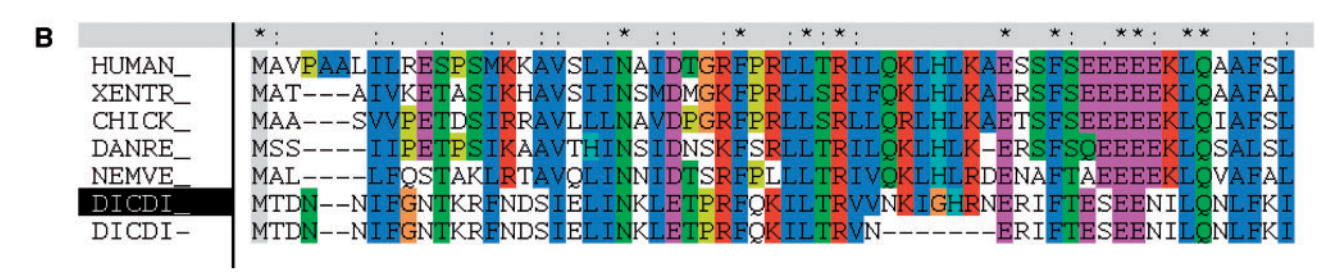
Figure 1. A modified gene model, commd10 (DDB_G0275249). (A) The gene prediction (underlined) selected a splice donor (gttaat) 21 nt upstream from that (gtaata) of the curated gene model (highlighted in yellow). This image was generated using the dictyBase Genome Browser. (B) The modified gene prediction is supported by sequence similarity. The new Dictyostelium gene model is indicated by a black shading of 'DICTY' on the labels on the left; the new gene model produces a better alignment than the gene prediction (bottom row), indicated by the gap in the alignment of the latter.

The work flow at UniProtKB/Swiss-Prot make it easy to assign the same name to homologous genes from several different species at once. This is very helpful for cross-species comparisons, but is not always possible: many genes have been published under certain names and cannot be changed without creating confusion. Large gene families