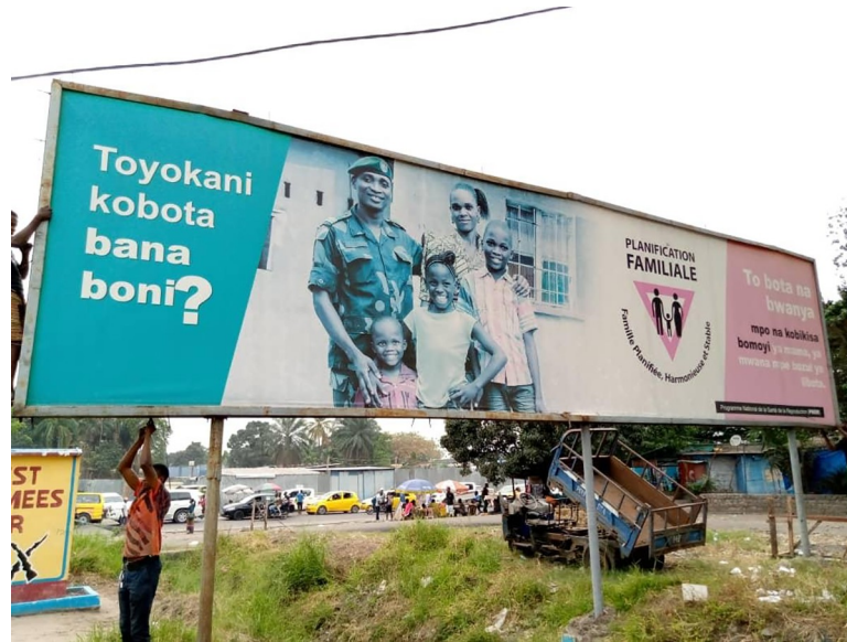
Fig 1. Family planning billboard depicting military personnel, located outside the military camp in Kinshasa, DRC.

https://doi.org/10.1371/journal.pone.0254915.g001