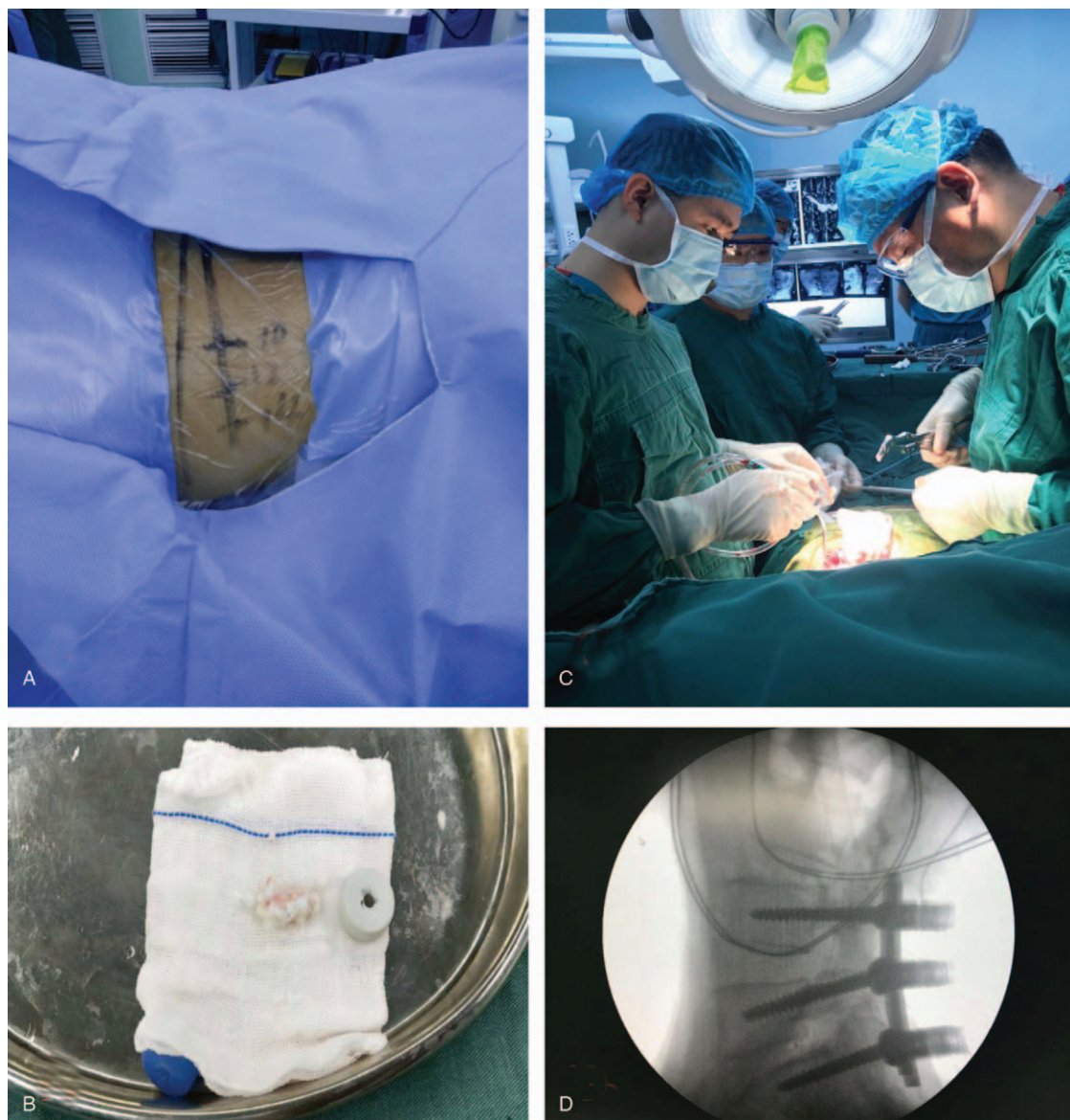
Figure 3. Intraoperative and postoperative pictures of the two groups of patients. (A) Localization during PTED surgery. (B) The nucleus pulposus from PTED surgery. (C) Hemostasis during TL surgery. (D) fixed after TL surgery. PTED = percutaneous transforaminal endoscopic discectomy, TL = traditional laminectomy.

hospitalization time, amount of bleeding and length of incision in the PTED group were significantly shorter than those in the TL group, and the differences were statistically significant ( P < .01 ).