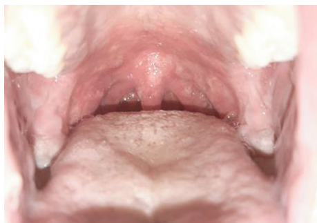
FIGURE 1: Mucosal involvement of the palate.