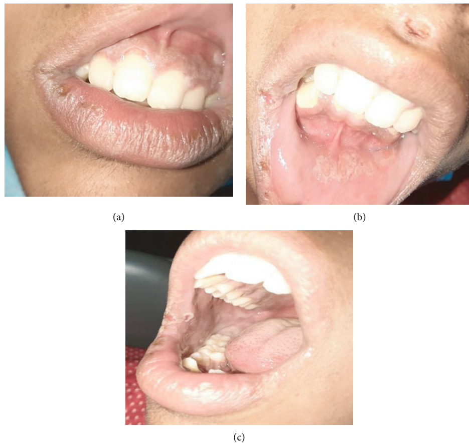
FIGURE 3: Oral lesions of oral erythema multiforme. The oral lesions involve (a) the gingival, (b) labial, and (c) buccal mucosae and vermillion of the lips.