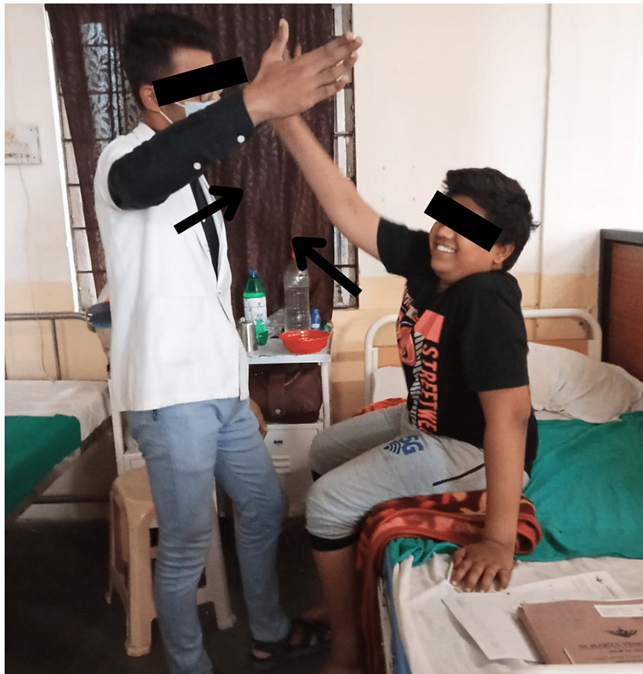
FIGURE 2: Delivering reach-out activities to the child.

Task-oriented exercises involved the performance of activities with the main emphasis on a particular target wherein the child was asked to achieve a particular target through the exercises. The exercises were reaching-out activities and walking on the ground. Reaching activities were performed in different fundamental positions where the child was asked to reach up to the hand of the therapist which was placed at a particular distance, and while reaching up to the hand of the therapist, the child had to modify her base of support which altered her center of gravity position (Figure 2). The base of support is a minimal or threshold area on which the body stabilizes itself to maintain a state of equilibrium, and if the base is wider, the center of gravity will be in a low position which means the stability would be at its optimum level. Usually, the position of the center of gravity is anterior to the second sacral vertebra. Thereby, reach-out activities enhanced the dynamic balance of the child. Walking on the ground or floor was beneficial in optimizing the gait parameters. Task-oriented training was given for half an hour and for six days a week which was followed up for four weeks.