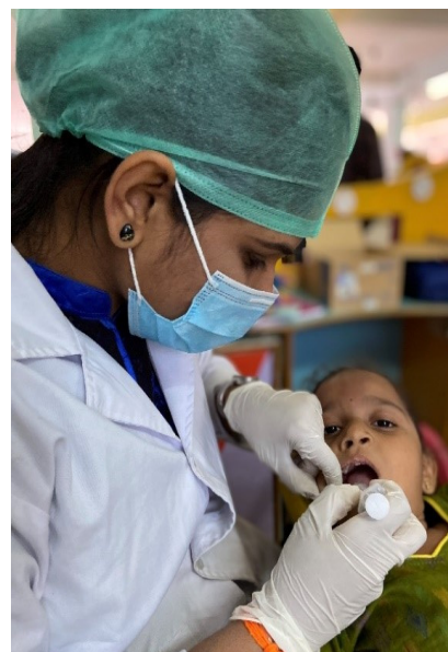
Fig. 3. Stroking the cheek and the extra-oral mucosa (Counter-stimulation)

Healthy children with normal body mass index percentile for age (ASA 1 classification) and anxious children aged 4–11 years (positive and negative Frankl behavior rating) who had no previous experience with LA administration were included in the study. Frankl's definitely positive and definitely negative children and those with special healthcare needs who required pharmacological behavior management were excluded from the study. The children were further divided into two age groups: group 1, 4–7 years old; group 2, 8–11 years old, keeping in mind that the psychology and mental status of 4-year-old children are different from those of 8-year-old children. Sample size determination was performed based on the findings from a pilot study that was conducted on 10 children (five in each group), taking an alpha error of 0.05% and power of 85 %; a final sample size of 100 was determined. Based on random