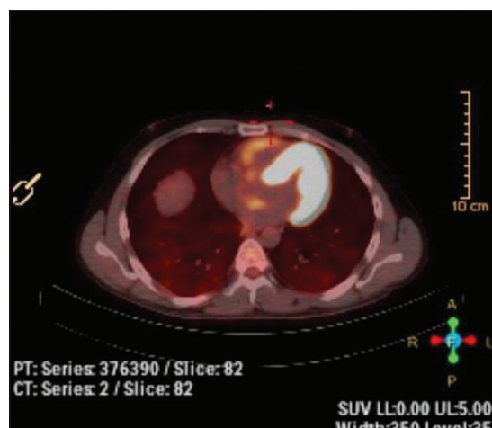
Figure 3: PET/CT showing low-grade metabolically active lesions in bilateral lung parenchyma, and low to moderate uptake in right paratracheal, subcarinal, right tracheobronchial, bilateral hilar, bilateral inguinal lymph nodes and aortopulmonary window